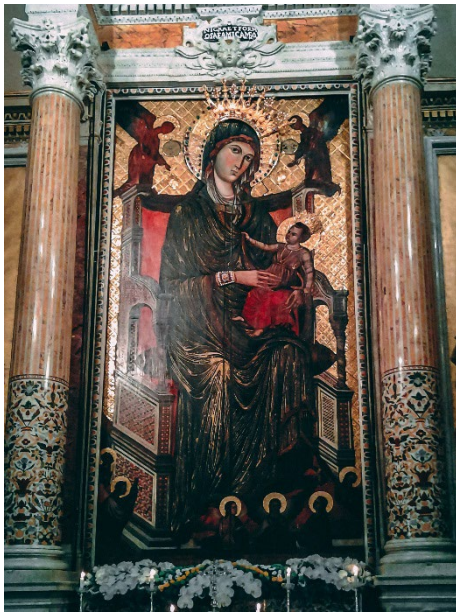
The Miraculous icon of the Madonna dei sette veli of Foggia (6 th Century – 17 th Century innovations including the repainting of the Virgin's face to appear more western in style)