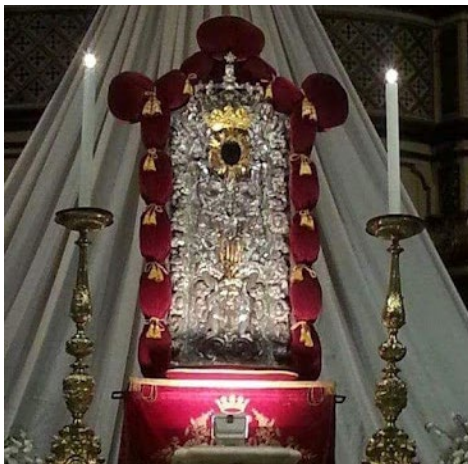
The Madonna of Corato (6 th Century) which is a blend of Byzantine and Renaissance art.