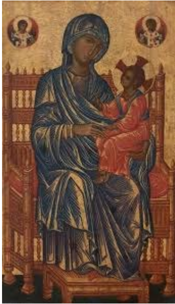
12 th Century icon from Constantinople.

Neither the tomb, nor death could hold the Theotokos, who is constant in prayer; thus we firmly hope in her intercessions. She became the Mother of Life and was translated to life by the One who dwelt in her virginal womb. Kontakion hymn of the Dormition.