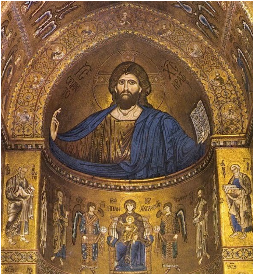
SANCTUARY WITHIN THE CATHEDRAL OF MONREALE - PALERMO

PENTECOST SUNDAY 2024AD - IN THE FULLNESS OF THE APOSTOLIC FAITH IMPARTED US!