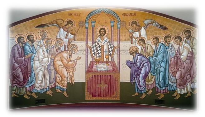
UBI CARITAS ET AMOR DEUS IBI EST